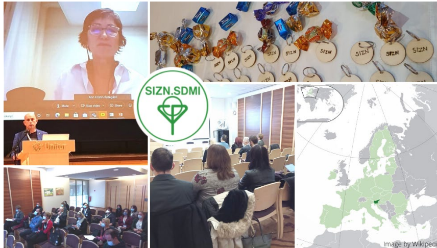
Figure 1: Photos of Slovenian Nursing Informatics Interest Group events

Established in 2001, the Slovenian Nursing Informatics Interest Group (slo. "Sekcija za informatiko v zdravstveni negi - SIZN") is a Special Interest Group within the Slovenian Medical Informatics Association (slo. "Slovensko društvo za medicinsko informatiko - SDMI"), and a member of IMIA-NI and EFMI-NI. The Slovenian Nursing Informatics Interest Group is an active group of experts from health and social care institutions, academia and industry who share a common interest in the development of nursing informatics.